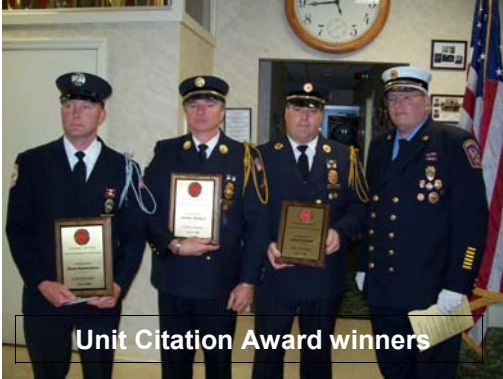
Unit Citation Award winners