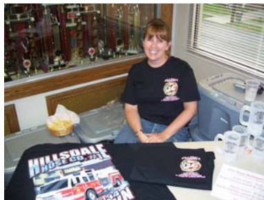
A smiling Auxiliary member greets guests and offers t-shirts and mugs for sale.