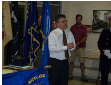
Hillsdale Fire Commissioner greets membership.