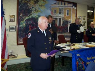
All members uncover for the invocation.