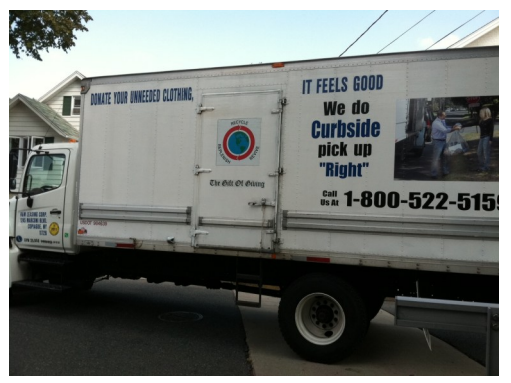
H&M Leasing truck doing by-weekly clothing pick-up in Little Ferry